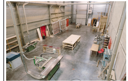
workshop & carpentry